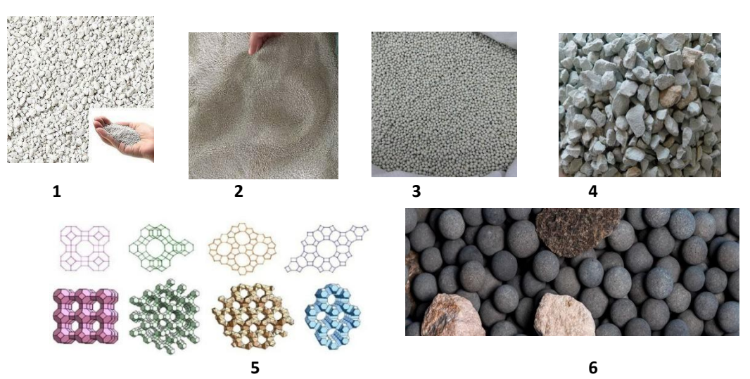
Fig. 1, 2, 3, 4, 5 and 6 Structural formulas of the Zeolite mineral and its modifications