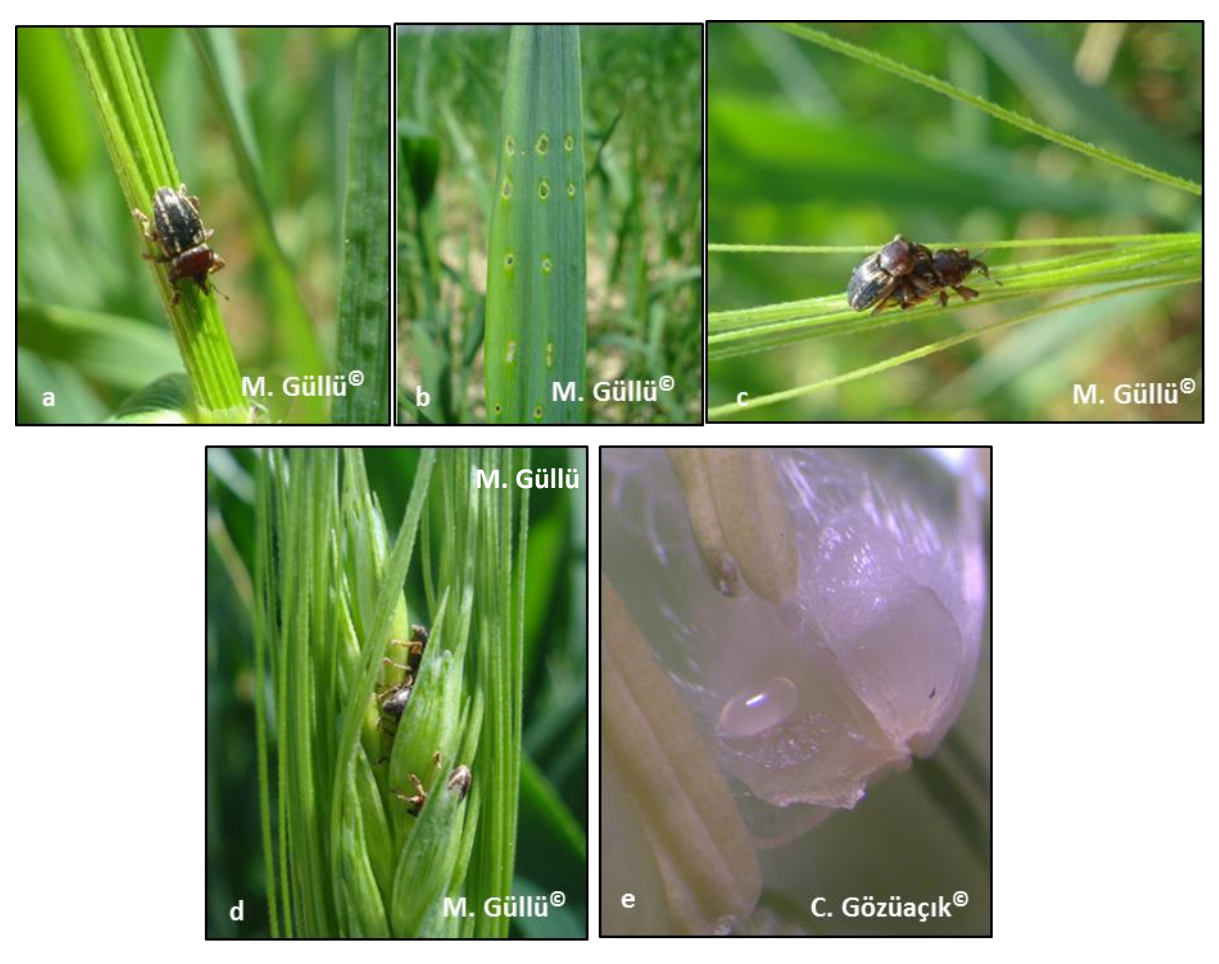
Figure 1.Cereal weevil, Pachytychiushordei : a) Adult b) Injury on leaf c)Adult mating d)Adults in spikelets e) Egg in spikelets