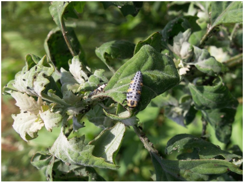
Picture 3. Aphids colonies and larvae C. septempunctata L. on a Chenopodiaceae

greatest predatory activity in 2012, when the greatest number of aphids was also recorded. The increased presence of weeds was registered in the peripheral parts of the research plots, where the increased number of aphids and ladybirds was also registered during all visual examinations. The most prevalent weeds were: Chenopodium album L. (Chenopodiaceae), Atriplex patula L. (Chenopodiaceae), Convolvulus arvensis L. (Convolvulaceae), Sorghum halepense L. (Poaceae), Cichorium intybus L. (Asteraceae) and Polygonum persicaria L. (Polygonaceae). The greatest number of aphids colonies was registered among weed species belonging to the family Chenopodiaceae (Picture 3).