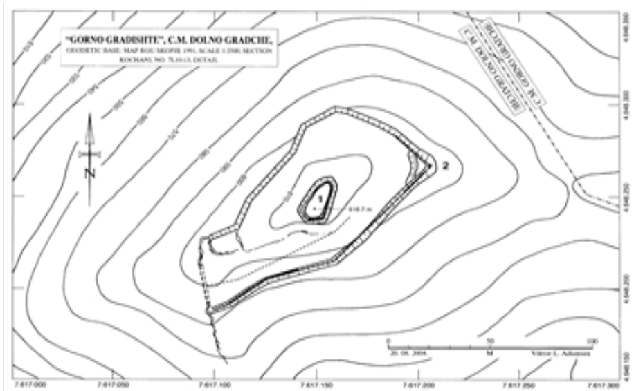
Map 3. The castle of Gorno Gradište (georeferenced plan V. L. Adams)

About 300 meters northeast of the city, on a higher and dominant hill, a castle was formed. A plateau with an irregular shape at a height of 616.7 m, spreading 134x60 m was leveled. A central building was formed approximately in the middle of the castle at the highest elevation. It is elongated and consists of a solid plaster wall with a polygonal shape. There are indications of the existence of a middle residential terrace that stretched along the perimeter southern defense wall at a slightly higher level (map 3).